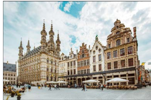
The Grand Beguinage , Leuven

April 23 General Meeting CPI Community Room 6990 W Hills Rd, Philomath, OR 97370