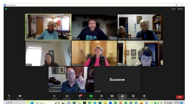
Board ZOOM meeting screen shot