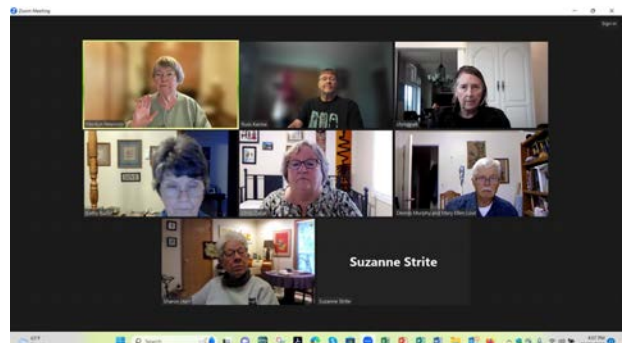
Board ZOOM meeting screen shot