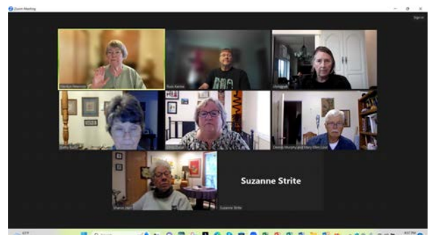
Board ZOOM meeting screen shot